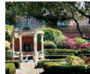
Janie Earle Furman Rose Garden (■)

Stroll around the lake on the walking trail. Visit the Bell Tower, which houses a 60-bell carillon and is a replica of the Florentine tower on the former Furman campus in downtown Greenville. The Amphitheater nearby is a picturesque venue for performances and events.