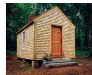
Thoreau Cabin (■ 11)