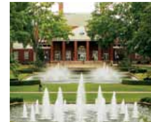
James B. Duke Library (■ 25)