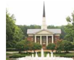
Charles Ezra Daniel Memorial Chapel (■ 24)

Built by Furman students, the structure is a replica of the cabin Thoreau inhabited while writing Walden . It is located in a grove of trees on the far side of the lake, about the same distance from the water as Thoreau's cabin sat from Walden Pond.