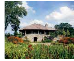
David E. Shi Center for Sustainability (■ 8)

The landscape architect is R.K. Webel of the noted New York firm Innocenti-Webel. Webel also redesigned the Mall and Lincoln Memorial areas in Washington, D.C. Included on the 750-acre campus are 2,000 cultivated trees of 30 varieties, plus extensive natural areas.