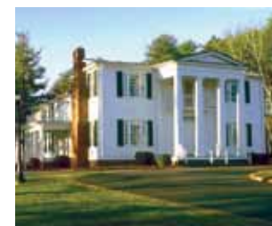
Cherrydale (■ 43)

At the center of the campus stands the library, a 120,000-square-foot facility named for an early 20th century North Carolina industrialist and philanthropist who included Furman in The Duke Endowment, a foundation that provides substantial annual support to the university.