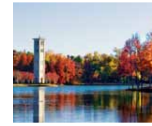
Lake and Bell Tower (■ 10) and Amphitheater (■ 9)

This center, named for Furman's 10th president, supports the study and integration of sustainability-related topics on campus as well as in the greater Greenville community.